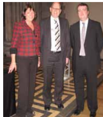
Minister's meeting at Mansfield Traquair, Edinburgh